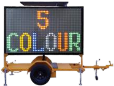
DTS5C DigiTrail Sign-5 Colour