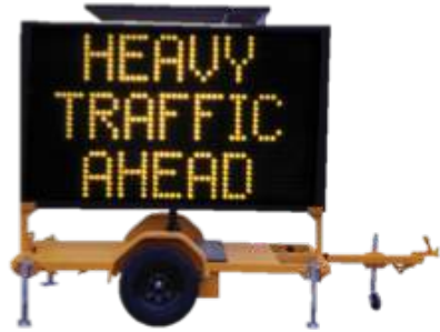
DTSA DigiTrail Sign-Amber