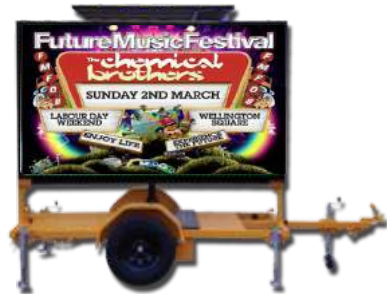
DTSFC DigiTrail Sign-Full Color